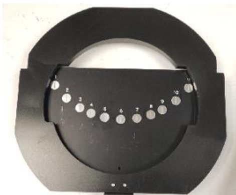
6 inch with 11 sensors in arc array

This means, if you are doing uniformity measurements, the Model 511 will provide mw/cm2 or mj/cm2, average value, percent uniformity, Min, Mid, Max, in real time data.